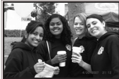
Dedicated Suitcase members spreading the word on Cal Day.

There is a wonderful way for you to reduce your taxes while supporting the Suitcase Clinic in its mission: all donations are completely tax-deductible. The Suitcase Clinic's non-profit tax ID code is #94-0294680.