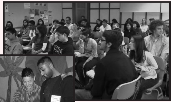
Top: An enormous crowd for Spring 2007 elections. It lasted for a few hours, as each candidate was thoroughly and thoughtfully discussed before casting our vote.

I believe that I speak for everyone when I say that the Suitcase Clinic has become more than just community service; we are a family who are passionate about improving the overall well being of everyone who does not have access to adequate healthcare.