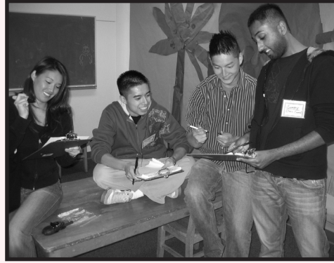
Bottom: These four officers discuss business (well, if you can call it business) in the med room. The med room is held in a childrens sector of the church we occupy, so everything is very vibrant and colorful.