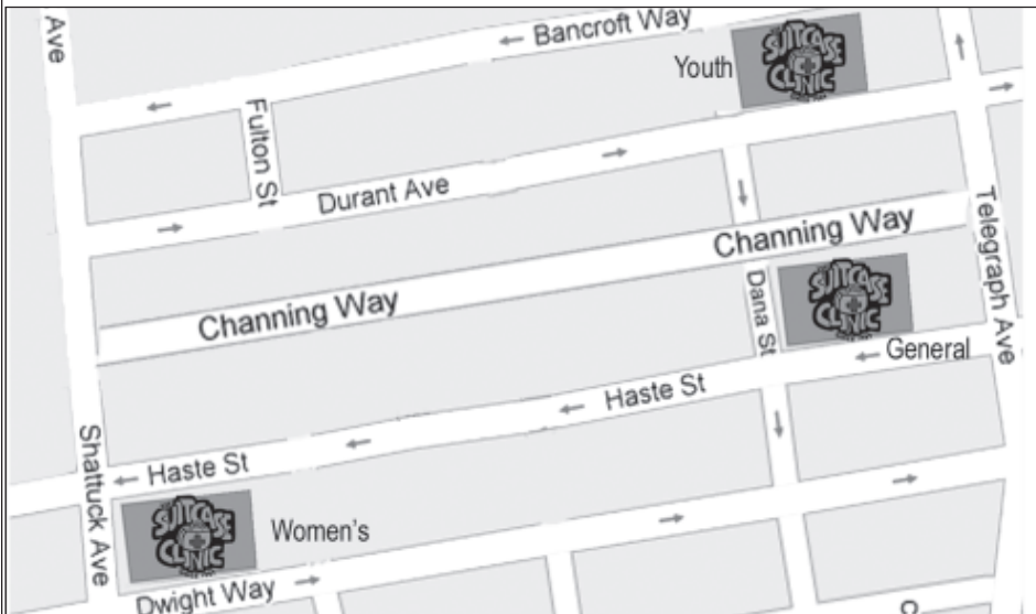
Map of Berkeley's "South Side"